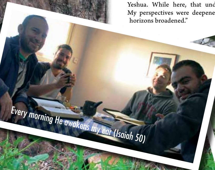
Every morning He awakens my ear (Isaiah 50)

"The internship was greater than I knew while I was in it. Only after I finished and looked back did I realize what a strong effect it had. When I came, I had no idea what Yeshua had in store for me. I came in faith, following His lead, and His grace met me here. I soon discovered that I was learning under an anointing. I also found that God had placed around me, not necessarily the men whom I would have chosen to live so closely with, but men who challenged me, sharpened me, and honestly cared for me. These friendships are still valuable to me. The lifestyle that was offered, of worship and study and service in community, surpassed all my expectations. This simple life is rich. I came with a certain understanding of life in Yeshua. While here, that understanding changed. My perspectives were deepened and my horizons broadened."