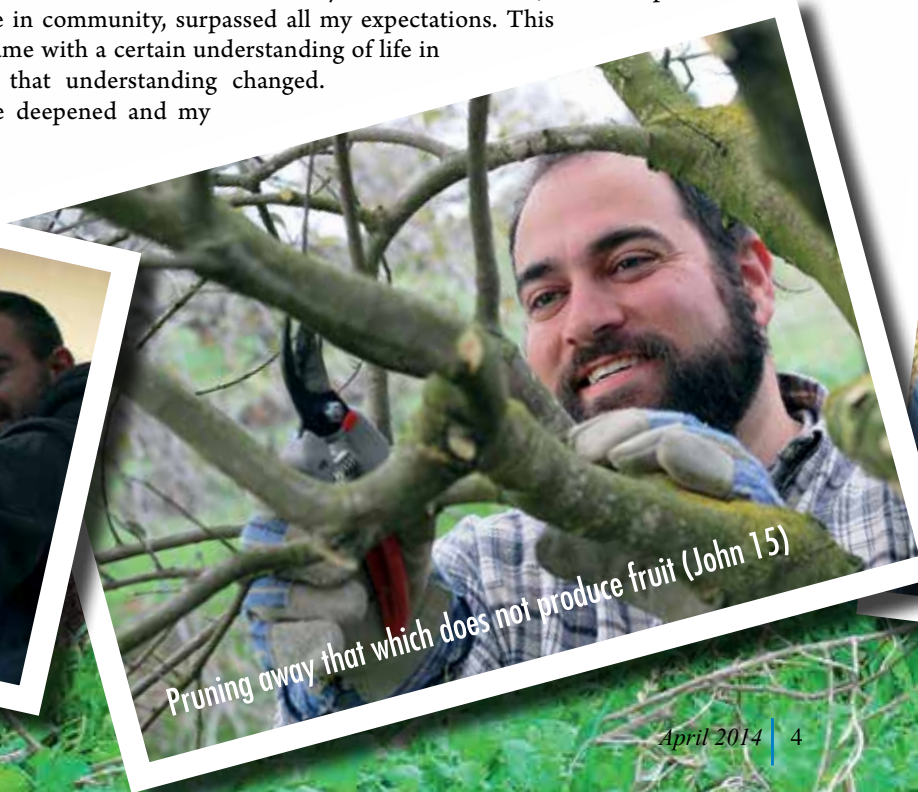
Pruning away that which does not produce fruit (John 15)